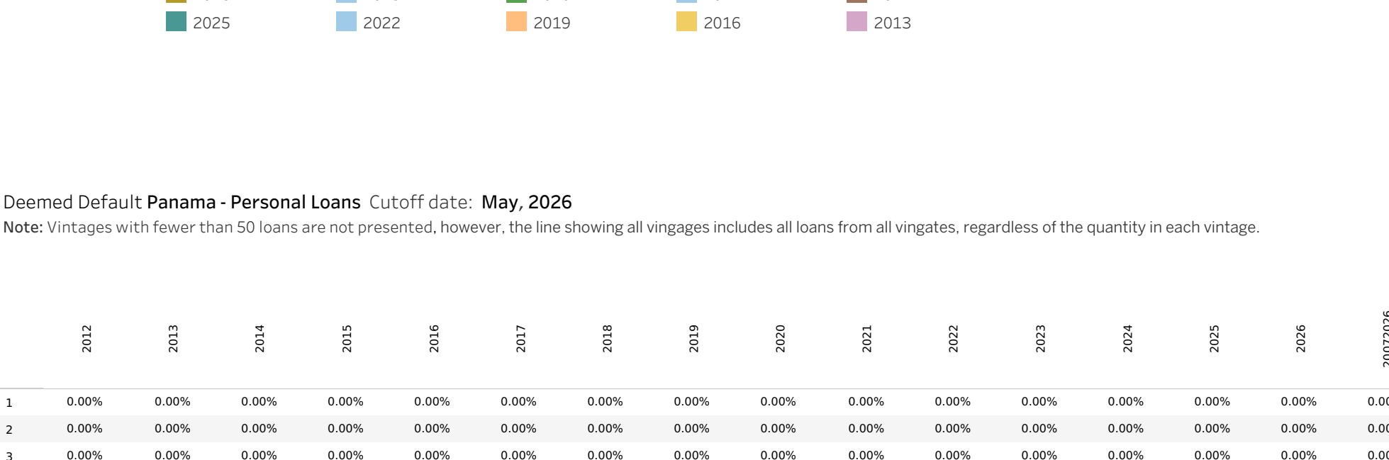
Deemed Default Panama - Personal Loans Cutoff date: May, 2026 Note: Vintages with fewer than 50 loans are not presented, however, the line showing all vintages includes all loans from all vintages, regardless of the quantity in each vintage.